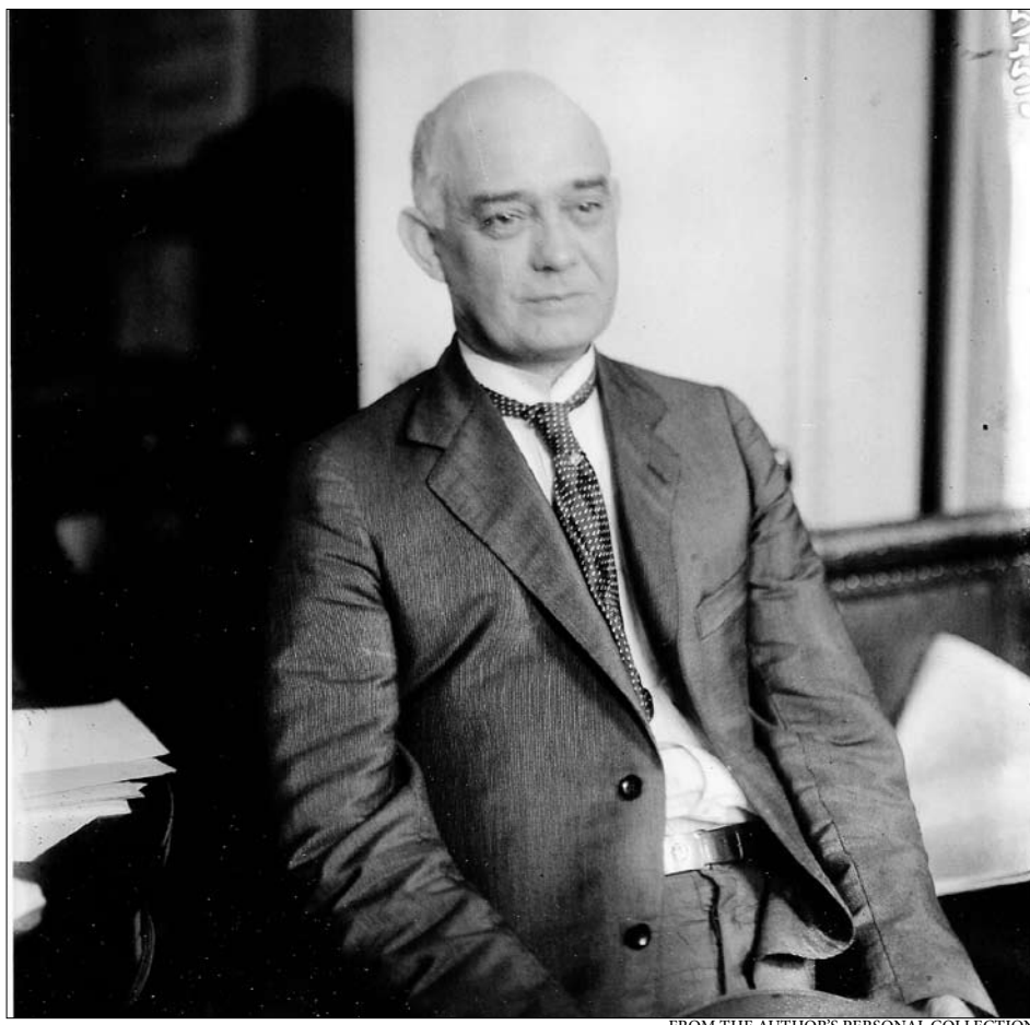
Governor Austin Peay of Tennessee.

Benton McMillin was seventy-seven years old in 1922 and despite his age, the "Old Warhorse" of Tennessee politics waged an active and energetic campaign. The contest for the Democratic nomination was quite close and Austin Peay won by just over four thousand votes. His majority came from his margin in Shelby County, which was more than seven thousand votes. Peay had the support of E. H. Crump, leader of the Shelby County political machine and it was a