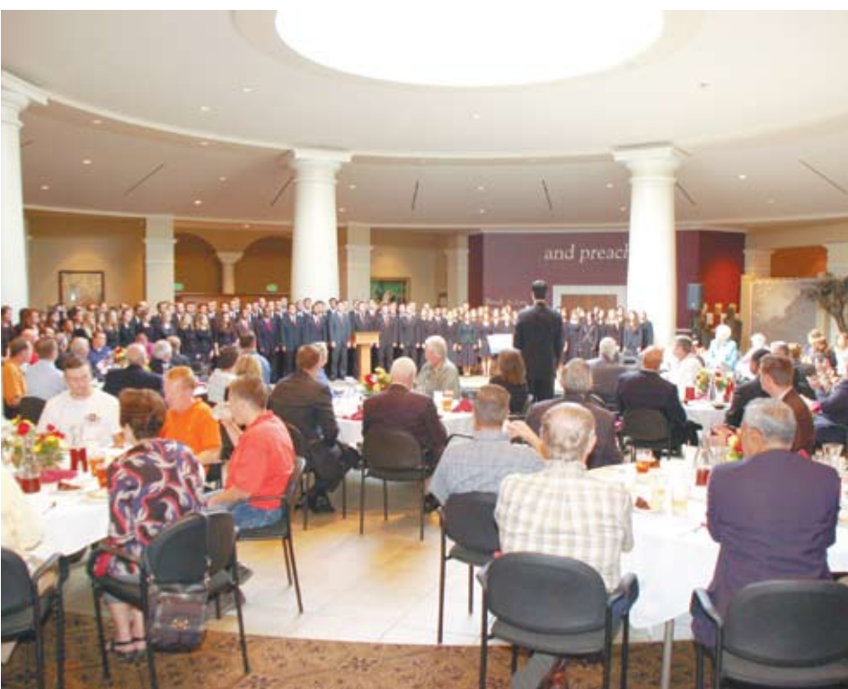
The Crown Business Forum was held on Thursday, September 20, around the Crown College Rotunda. Guests enjoyed a luncheon and concert before the program.