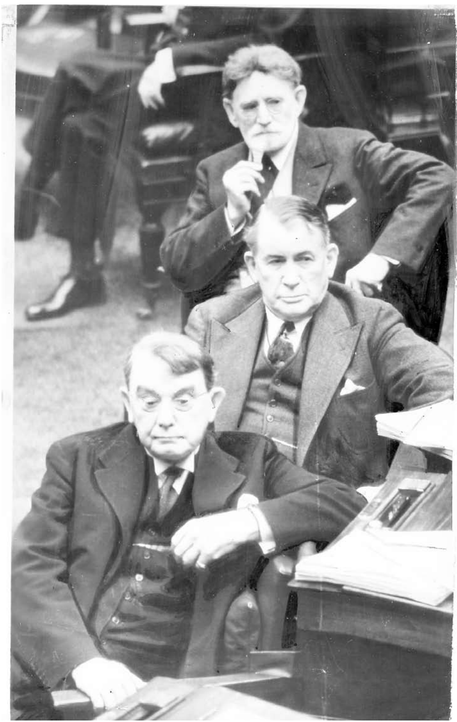
Senators Kenneth McKellar, Alben Barkley of Kentucky and J. Hamilton Lewis of Illinois on the floor of the United States Senate in 1939.

In 1945 Senator Kenneth McKellar was seventy-six years old and had served in the United States Senate for twenty-nine years, longer than any other Tennessean. McKellar was at the peak of his influence and power in the Senate. He was the Chairman of the most powerful Senate Committee, Appropriations, through which every dollar spent by the Federal government had to be approved. To add to his prestige, McKellar had also been elected President Pro Tempore of the United States Senate by his colleagues.