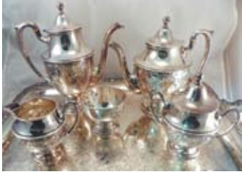
This rare Dunkirk hand chased sterling service circa 1940 will be available at the September 29 auction

We have everything from rare books from the 18th century to a 1850s British Irish Brigade Mess Jacket. Go online to see the vast array of items that will go on the block. See you there!