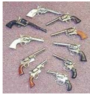
Antique guns are exempt from FFL transfer