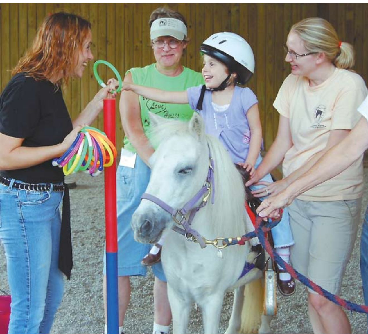
TRAK students often form a bond with specific horses.