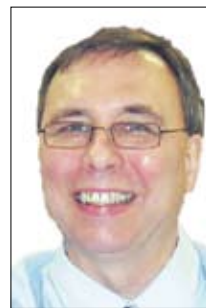
By Carl Sloan

This week I wish to discuss antique firearms as well as a new service coming soon to Fountain City Auction when we will be licensed to sell and auction firearms. Each state is different in their definition of "antique" when it comes to guns and in Tennessee the rule is that is the weapon was made in 1872 or earlier, it is considered