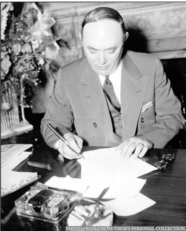
Senator George L. Berry

Berry had not even temporarily surrendered his post as the president of his union and his last act as a member of the United States Senate was sour. As the Senate contest had been a special election, the winner should have been sworn-in just as soon as the election results were