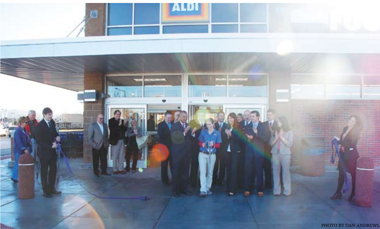
Following the ribbon cutting, customers were invited to sample ALDI exclusive brands, tour the new store and shop for their favorite grocery items.