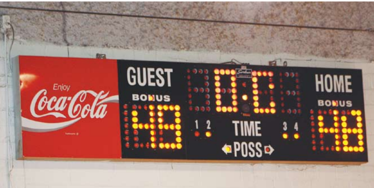
The scoreboard tells the tale as South-Doyle held on for a 49-48 win at Halls Middle School on Jan. 26. The hard earned victory enabled the Lady Cherokees to keep their perfect league record intact.