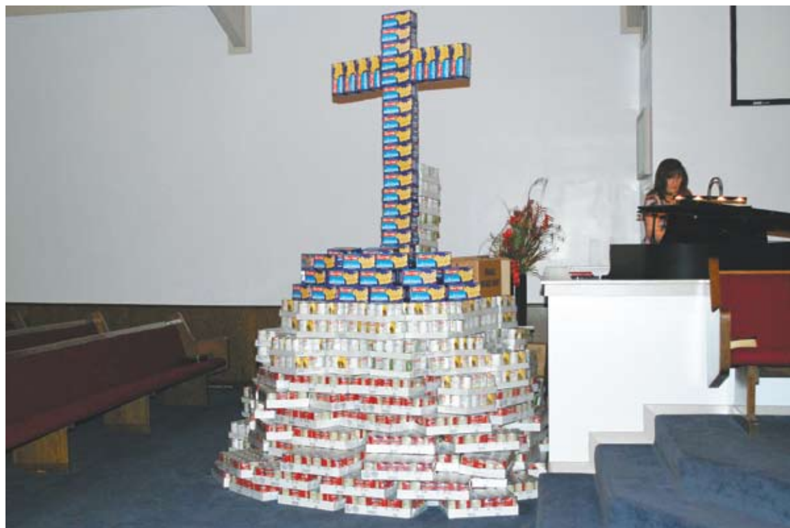
SOUPER BOWL. Sharon Baptist Church just ended the 17th year of the "Souper Bowl." Throughout the month of February, different Sunday School Departments collected money for their assigned food (Crackers, Macaroni and Cheese, Peanut Butter, Can Soup and Vegetables). The food goes to support Western Heights Ministries and Montgomery Village Ministries. Both ministries are a part of the Knox County Association of Baptists. This year the cost of the food given by the church through the Souper Bowl was almost $5,000.