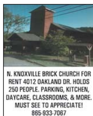
N. KNOXVILLE BRICK CHURCH FOR RENT 4012 OAKLAND DR. HOLDS 250 PEOPLE. PARKING, KITCHEN, DAYCARE, CLASSROOMS, & MORE. MUST SEE TO APPRECIATE! 865-933-7067