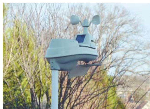
This Acu-rite Personal Weather Station transmits precipitation, wind speed and direction, humidity and other meteorological data through a wireless connection.