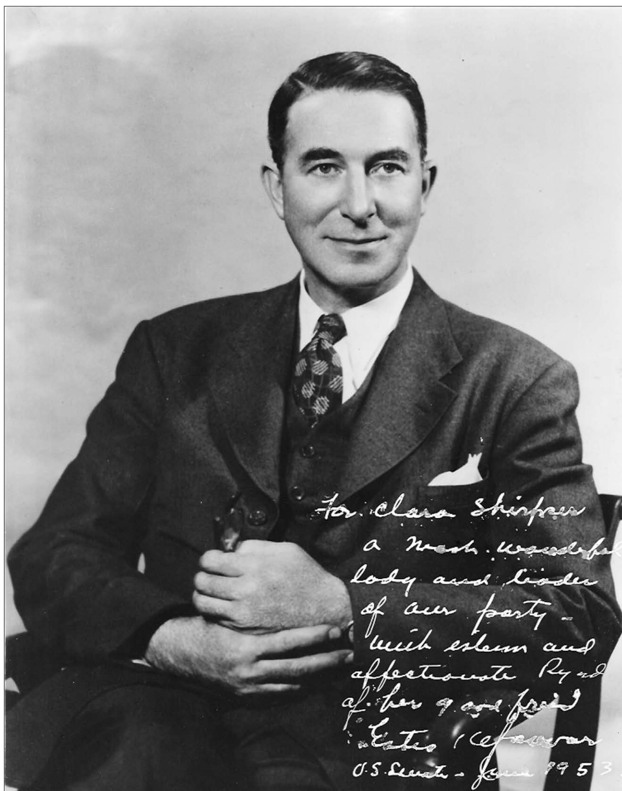
Autographed photo of Senator Estes Kefauver

Young Estes attended the University of Tennessee and spent a year teaching before leaving for Yale University. Kefauver not only earned a law degree from Yale, but graduated