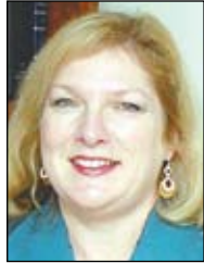
By Sharon Frankenberg, Attorney at Law

The issue of grandparents' visitation rights has been addressed by the United States Supreme Court in the case of Troxel v. Granville, 530 U.S. 57 (2000). In that case, an unmarried couple had