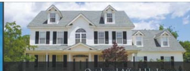
Quick and Affordable Insurance

Homeowner's Insurance | Automobile Insurance | Business & Commercial | Life & Health