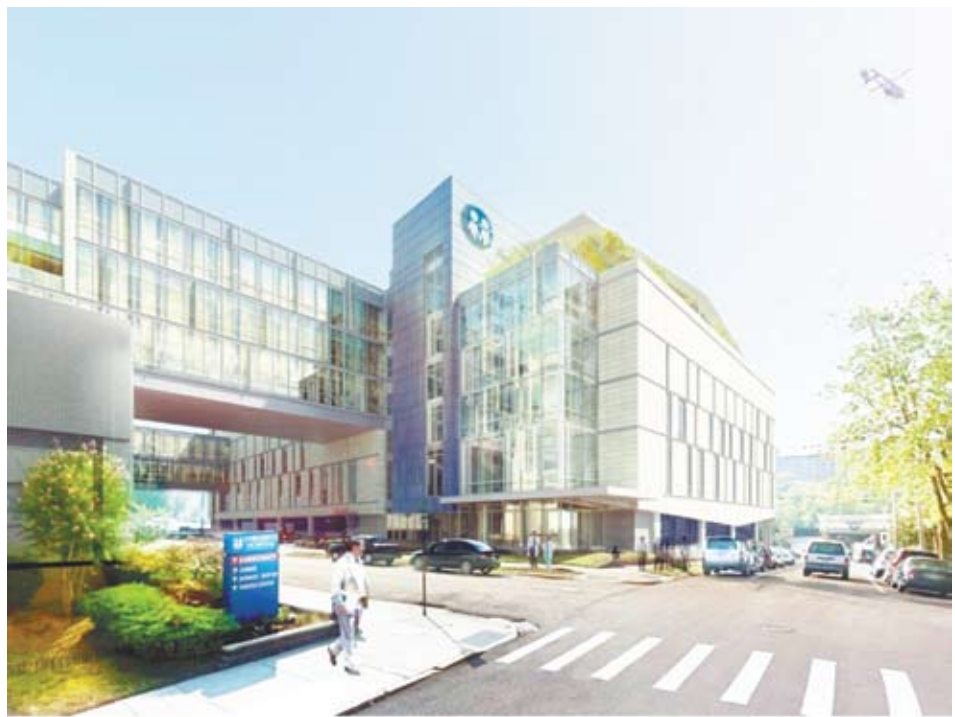
Artistic rendering of the main entry proposed for the East Tennessee Children's Hospital expansion.

For more information call the Children's Hospital Development office at (865) 525-GIVE or visit the Children's Hospital website at www.etch.com/expansion .