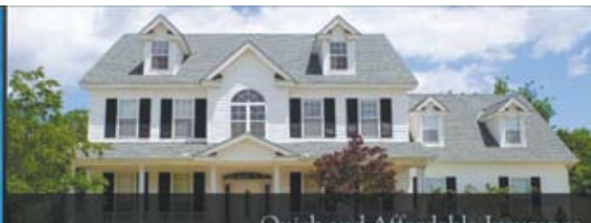
Quick and Affordable Insurance

Homeowner's Insurance | Automobile Insurance | Business & Commercial | Life & Health