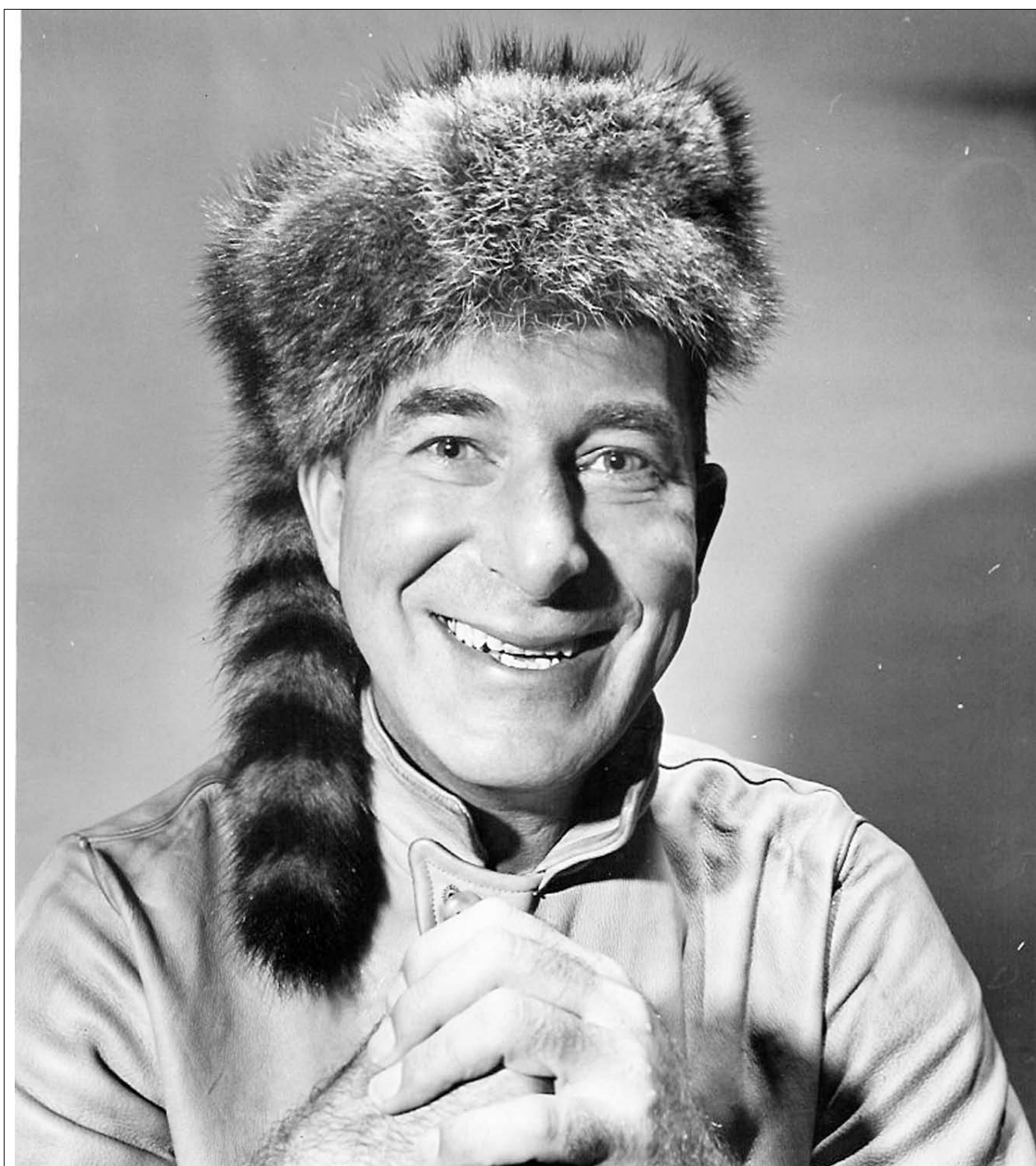
FROM THE AUTHOR'S PERSONAL COLLECTION.