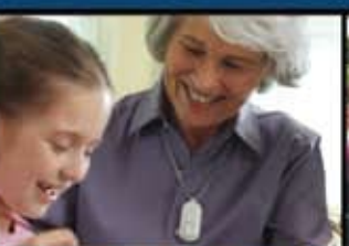
Lifeline Alert System