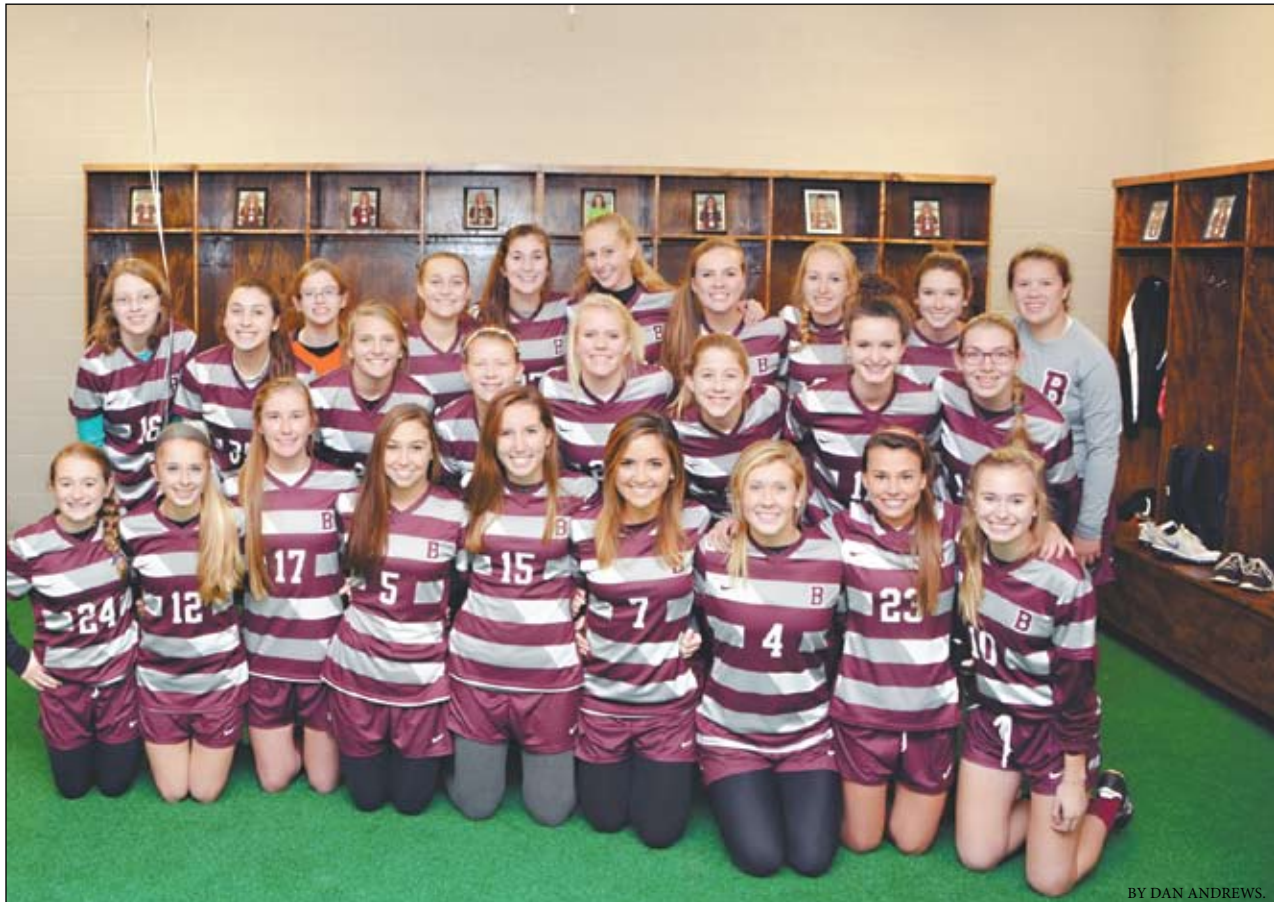
The Bearden High School girls soccer team celebrated the opening of the new locker room complex at Bruce Allender Field Tuesday night. The Lady Bulldogs donned new uniforms on an evening that included an intersquad scrimmage.