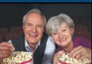
Theater & Amenities