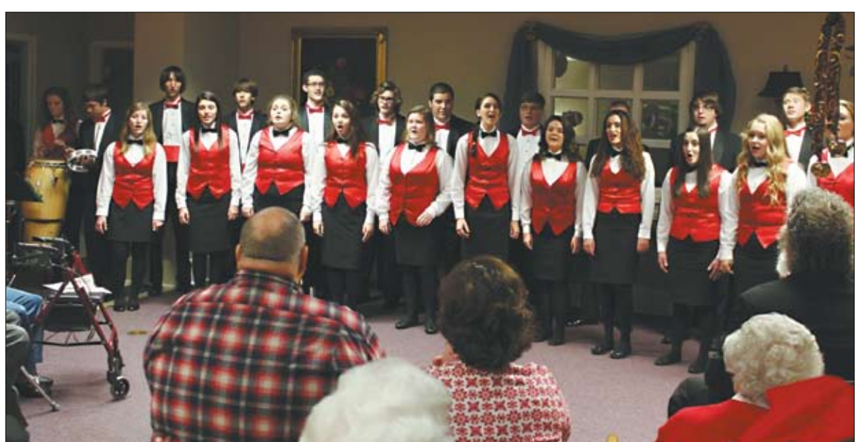
Windsor Gardens Assisted Living recently held its 14th Annual Christmas Celebration. Staff and residents were treated to the fabulous sounds of the Powell High School Choir, who has been making an appearance at Windsor Gardens' Christmas Celebrations for many years.