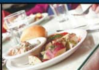
Breakfast & Dinner