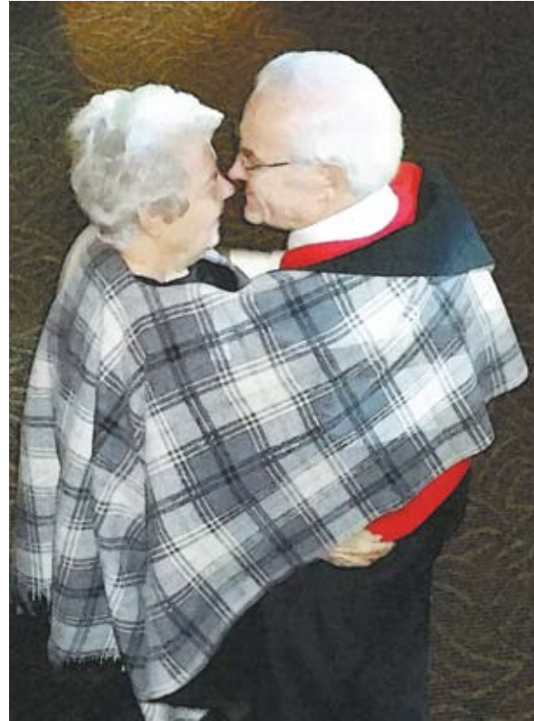
"That is Love,"