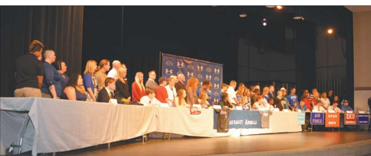
Farragut High School athletes finalize their college plans on National Signing Day at a recent ceremony in the FHS Auditorium.