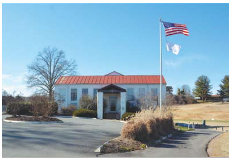
The Williams Creek Golf Course Club House has an unusual and interesting history.

Two years later the state bought the home and added to it. It wasn't until the 1960s until the African-American students