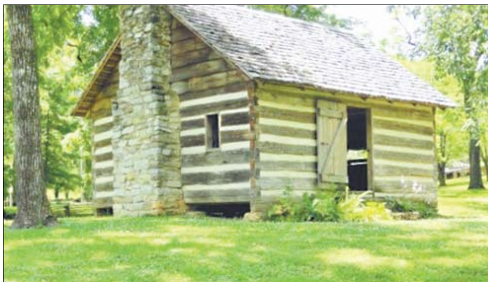
What does the historic Sam Houston School House in Blount County have to do with the settlement of Texas? There's a direct link that brought settlers and fighters to free Texas of Mexico and plant a firm footprint of the Volunteer State in the Lone Star State.

There's even a Tennessee Colony in Texas, 12 miles from Palestine and that settlement is one of the earliest historic communities in Anderson County