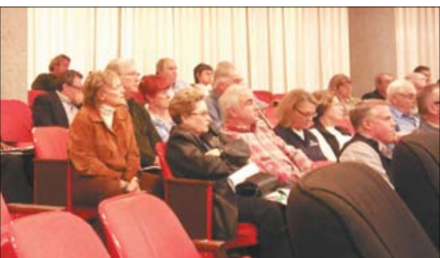
Residents turned out to the Thursday, Nov. 8 meeting of the Knoxville/Knox County Metropolitan Planning Commission to protest proposed developments in their neighborhoods.