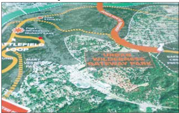
A representation of the proposed Urban Wilderness Gateway Park showing its connection via greenway to Baker Creek Preserve.