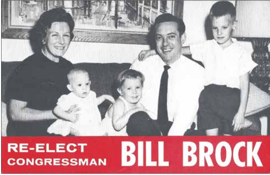
Congressman Bill Brock and family in campaign postcard.

For one who was the author and architect of the "Great Society" LBJ came into office signaling a need for economy in government, an approach that had the strong support of Congressman Bill Brock. "President Johnson's recognition of the urgent need for a reduction in inflation-producing deficits gives all Americans real hope for a meaningful tax reduction," Brock said. "If Congress will react responsibly, enacting further economies where possible, the whole nation will be the beneficiary. I personally will do all I can to support this goal." Even some Democrats were dubious about Johnson's proposals. Senator John McClellan of Arkansas mused it would