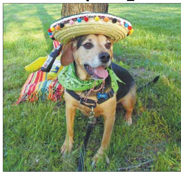
Hobo the Wonder Dog Enjoys the Shade of Summer

Ticks: According to the Centers for Disease Control and Prevention (CDC) Lyme disease affects dogs and their human companions. Lyme disease is transmitted though tick bites and can cause recurring health problems. As with