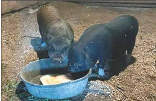
Clyde and Delmer are two pot bellied pig mixes available for adoption at Hooves & Feathers in Halls.

If you miss the Central Filling Station collection days you can leave your donation at the front gate with a note with a note containing your name, telephone number and mailing address. Hooves & Feathers will make sure you receive a "Thanks You"