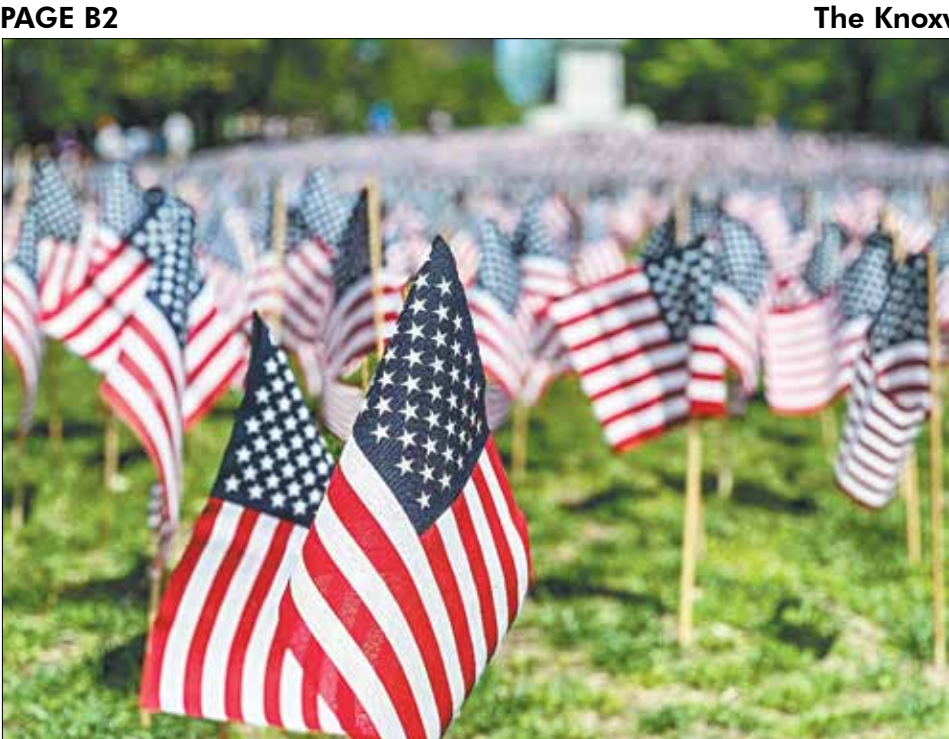
Picture of 37,000-plus flags planted at the Memorial Day Flag Garden in Boston Common representing the Massachusetts men and women who have died defending the country since the Revolutionary War, courtesy of Bryce Williams.