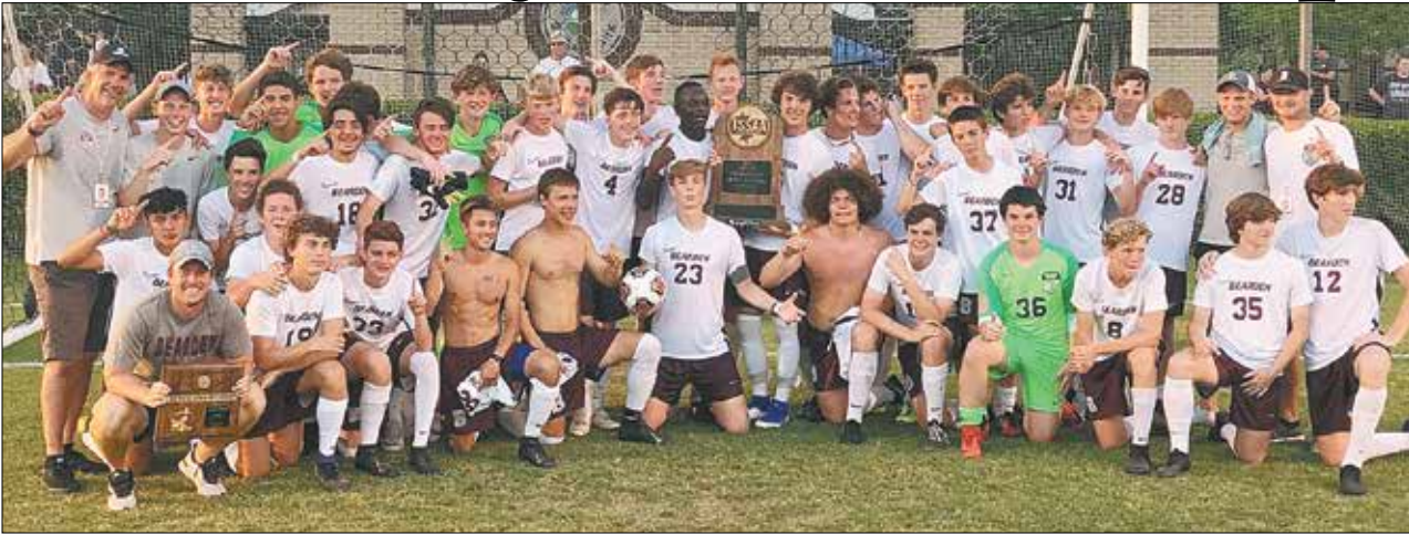
The Bearden boys soccer team celebrates their fifth state championship following a victory in penalty kicks over Station Camp on Friday, May 24 in Murfreesboro.