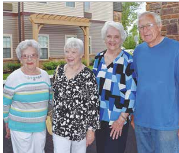
Residents who moved into Parkview Retirement Community before its grand opening stand proudly for a picture with their new home.