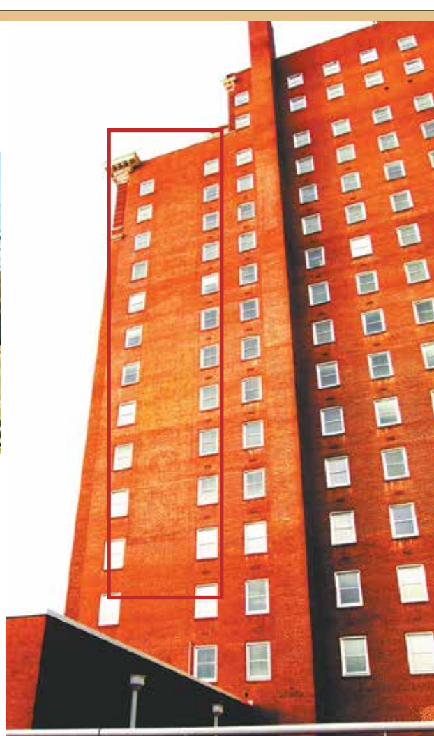
Barely visible now but at one time the Andrew Johnson Building advertised on the back side of the building to lure travelers into the historic hotel.

BROADWAY CARPETS INC. www.broadwaycarpets.com