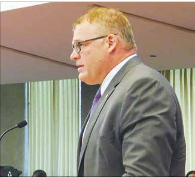
Knox County Mayor Glenn Jacobs told the Knox County Commission that funding the indigent care program is like "government throwing money at something and expecting it to get better." The commission passed the mayor's proposed budget after much discussion about the health department's funding cuts.