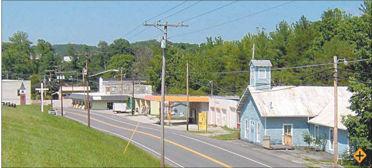
Sunbright is in the Cumberland Mountains. The little town has only about 500 residents but has its own police department, fire hall, and library. The Sunbright School has a very high participation of the students in sports.

Sunbright has a youth club, fire hall public library