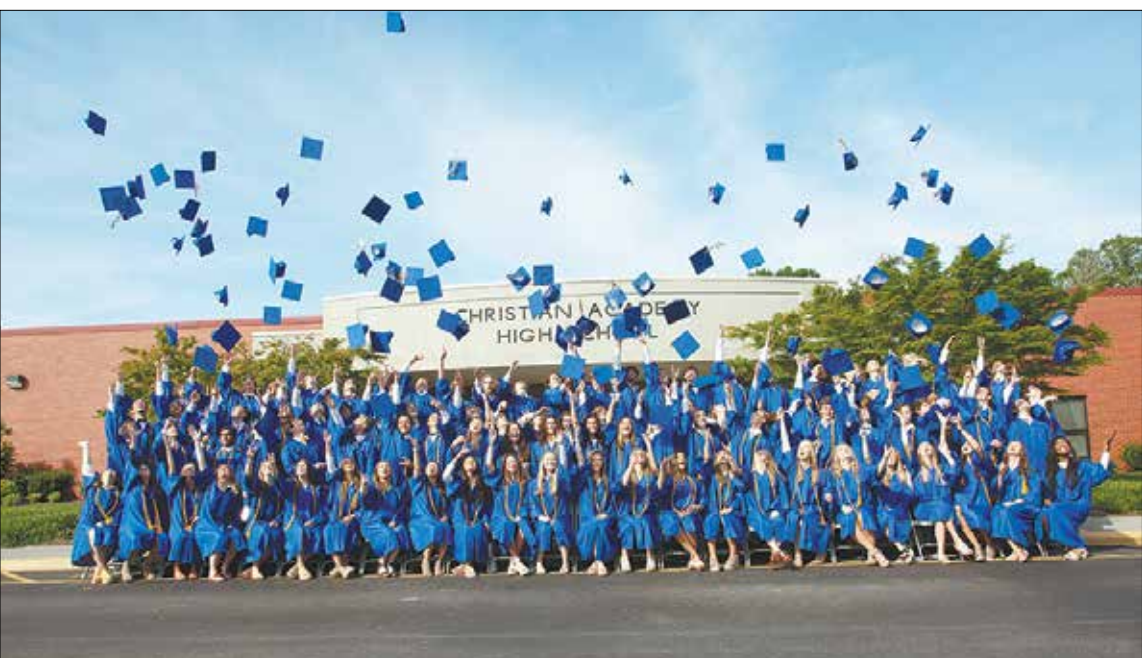
All 97 seniors having chosen to pursue higher education, threw their caps high after the May CAK graduation ceremony