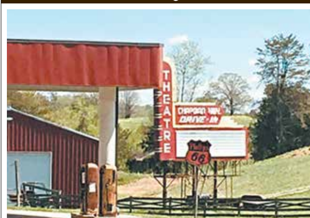
The original sign for the Chapman Highway Drive In Theatre now stands on a farm on West Emory Road near Rutledge Pike. The sign was saved from destruction when the old theater closed.

All around Knoxville the city's history is winking at you although you may not have noticed. Here and there on some of the older buildings, if you look closely enough, you can see the past appearing as faded or painted-over business names or advertisements on the brick walls.