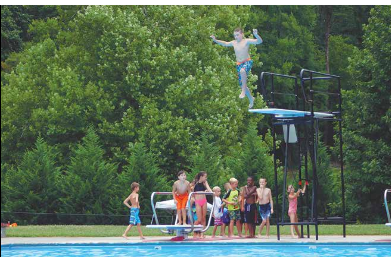
A boy jumps off the high dive at Inskip Pool last week as others wait their turn.