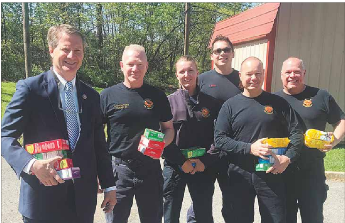
Congressman Tim Burchett visited the Knoxville Fire Station # 20 Friday morning to present the first responders boxes of Girl Scout cookies. He spent much of the day delivering the cookies around his congressional district.