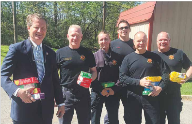
Congressman Tim Burchett visited the Knoxville Fire Station # 20 Friday morning to present the first responders boxes of Girl Scout cookies. He spent much of the day delivering the cookies around his congressional district.