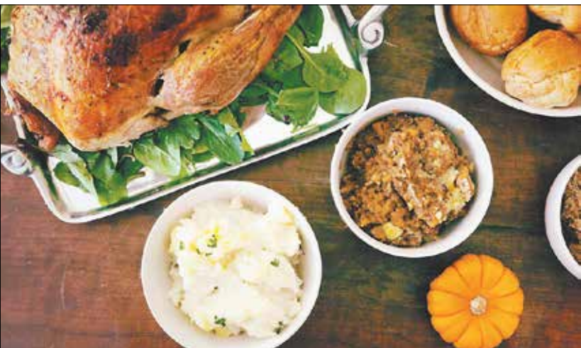
Tennesseans will find higher prices at the grocery store for staple items needed to prepare the traditional Thanksgiving meal this year. UT Extension surveyed grocers statewide to identify the average cost consumers can expect.