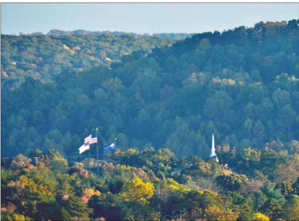
From a distance, picture of the flags at Clear Springs Baptist Church, courtesy of Perry McGinnis.