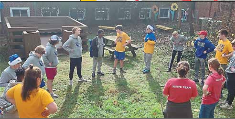
Left: Karns football players and wrestlers play a game called "Pterodactyl" with the kids at Beaumont Elementary School.