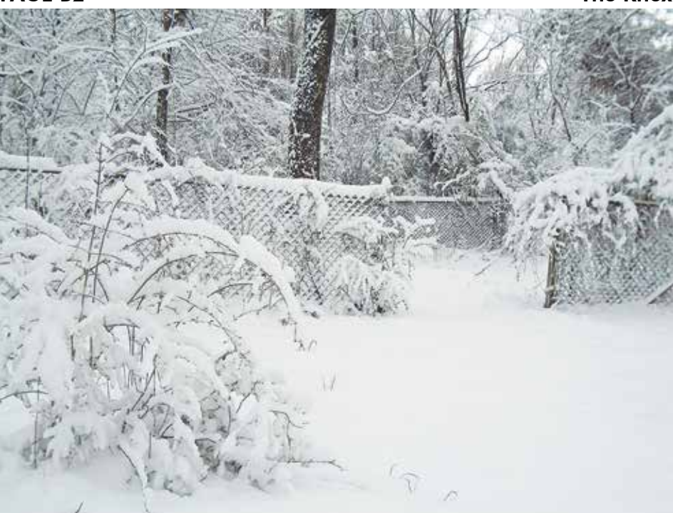
Picture of the beautiful snow on Christmas Day 2020.