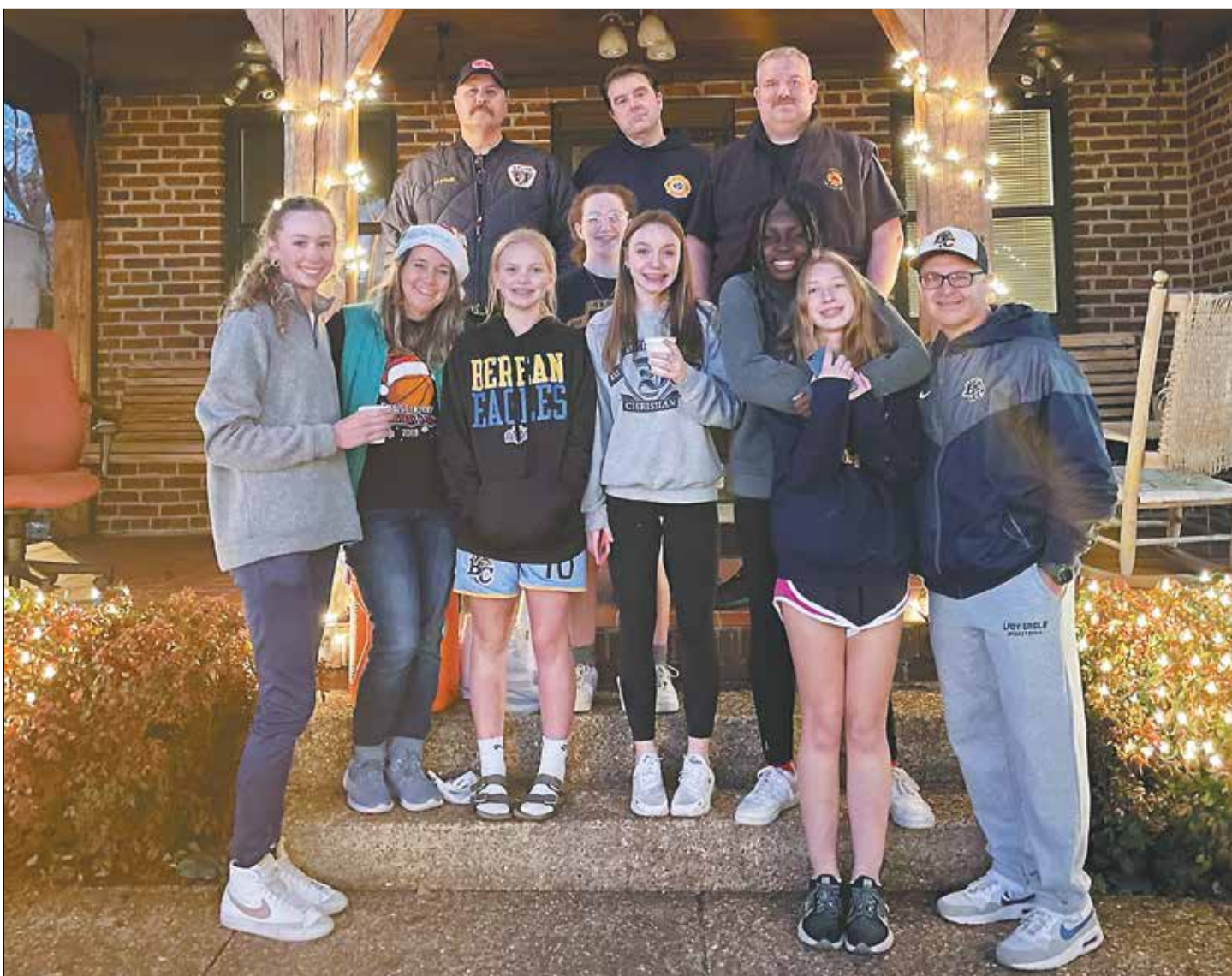
As the Christmas lights shine, the Berean Christian girls basketball team enjoys some hot chocolate and time with the firemen at Fire Station No. 11.