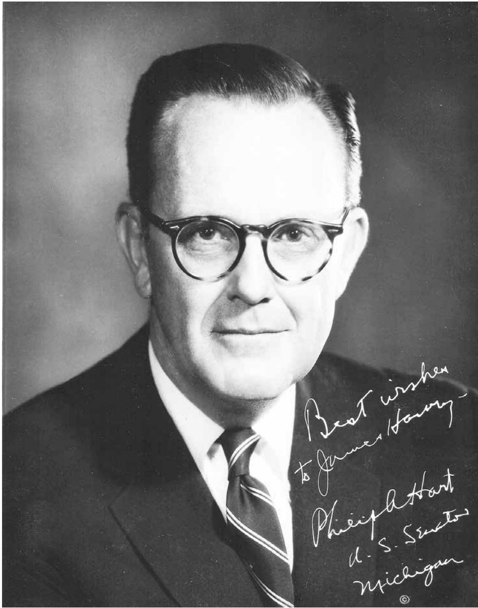
FROM THE AUTHOR’S PERSONAL COLLECTION.