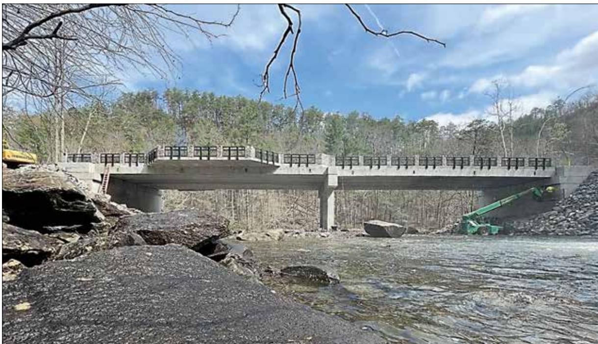
There's no more standing in traffic to see Bald River Falls. The new bridge has a viewing platform and additional parking across the bridge.

We are inviting you to join our family here at Pinnacle Assisted Living!