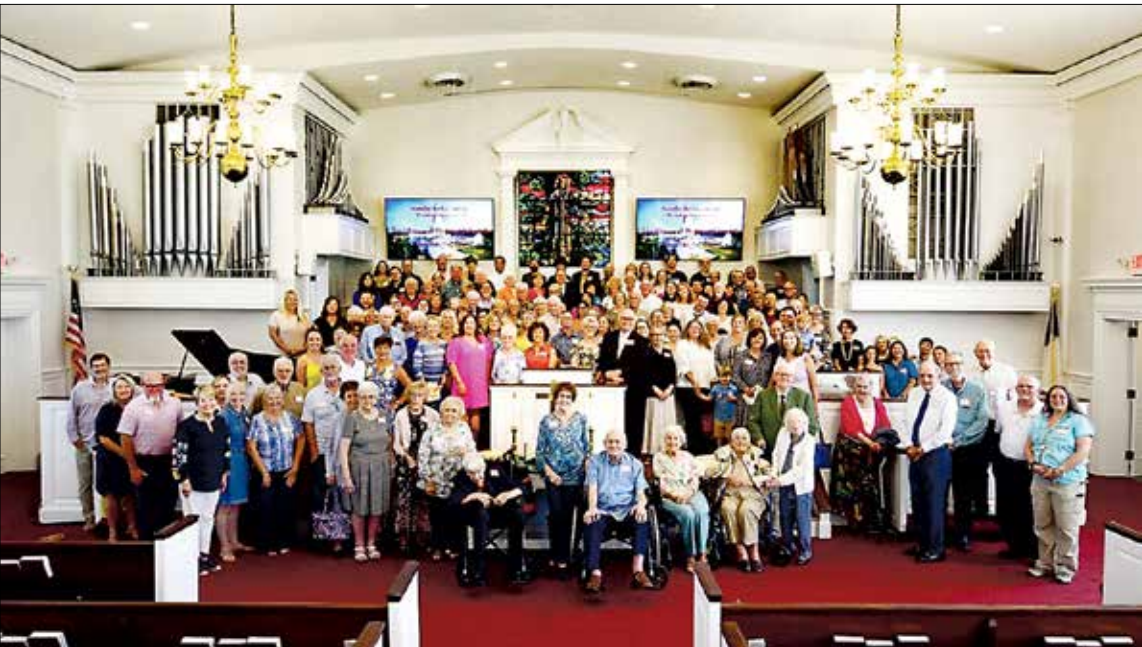
A portion of members of the Smithwood Baptist congregation at the 180th anniversary celebration on August 10, 2025. Smithwood is located at 4914 Jacksboro Pike in Fountain City.