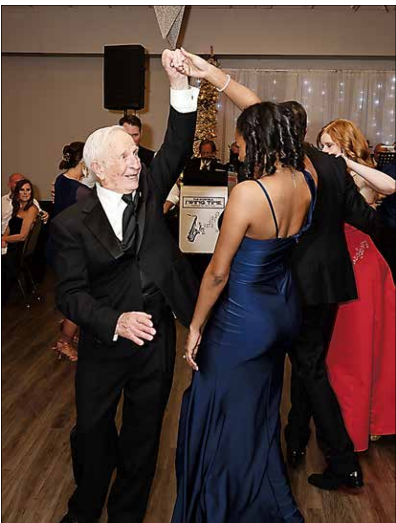
The Snowflake Ball is an evening of entertainment with live music, dancing, networking, dinner, a silent auction, and a King and Queen crowning. Proceeds benefit the Knoxville-Knox County Community Action Committee's Senior Companion program by providing a stipend, transportation, and meals for Senior Companion volunteers.

the Snowflake Ball, please visit knoxseniors.org . Tickets for the fundraiser are $100 each. Funds raised from the Snowflake Ball support the Senior Companion Program, which mobilizes volunteers 55 Continue on page 4