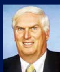
By John J. Duncan Jr.

Democrats all over the country are gleeful because of one word – affordability. They seem to believe that if they shout this word enough, it will stop the downward slide their party has suffered over the last several years.