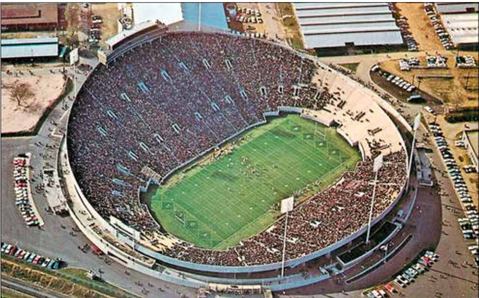
Ole Miss and Tennessee played Nov. 13, 1965, for the first time at Memphis Memorial Stadium after years of playing at Crump Stadium.

Alabama did get in one last shot at Auburn fans before the 1989 game, raising the specter of a