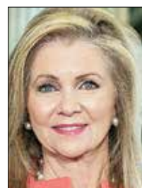
By Marsha Blackburn U.S. Senator for Tennessee

Last week marked the beginning of the 2026 tax season, which will deliver historic relief for Tennesseans thanks to the Working Families Tax Cuts (WFTC) signed into law