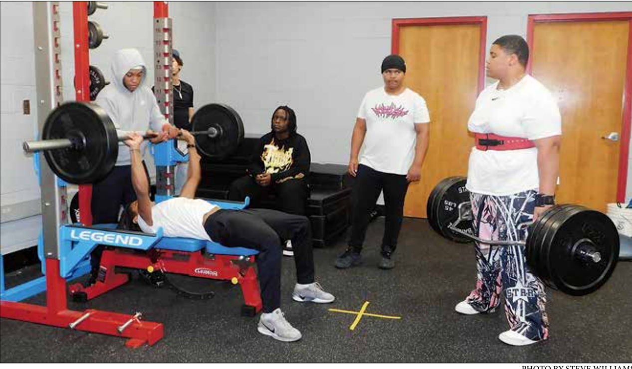
Austin-East baseball players work out in the weightroom Friday. The Roadrunners also will be on the field today for the TSSAA's first official practice date.