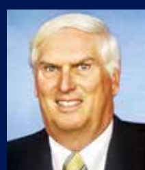
By John J. Duncan Jr.

The Democrats and the national media they control got in a big uproar when President Trump said a few days ago that he wanted Republicans to "nationalize