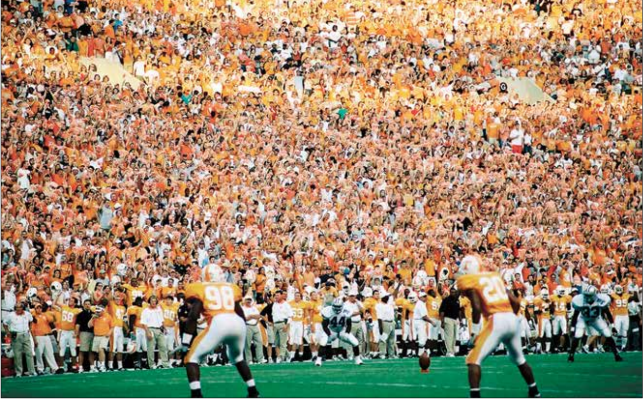
College football fans choose up sides early in life and never really change their minds about their favorite team.

Fans make every effort to be present, regardless of the weather. They do what it takes to obtain the requisite number of tickets, pull together the tailgate,