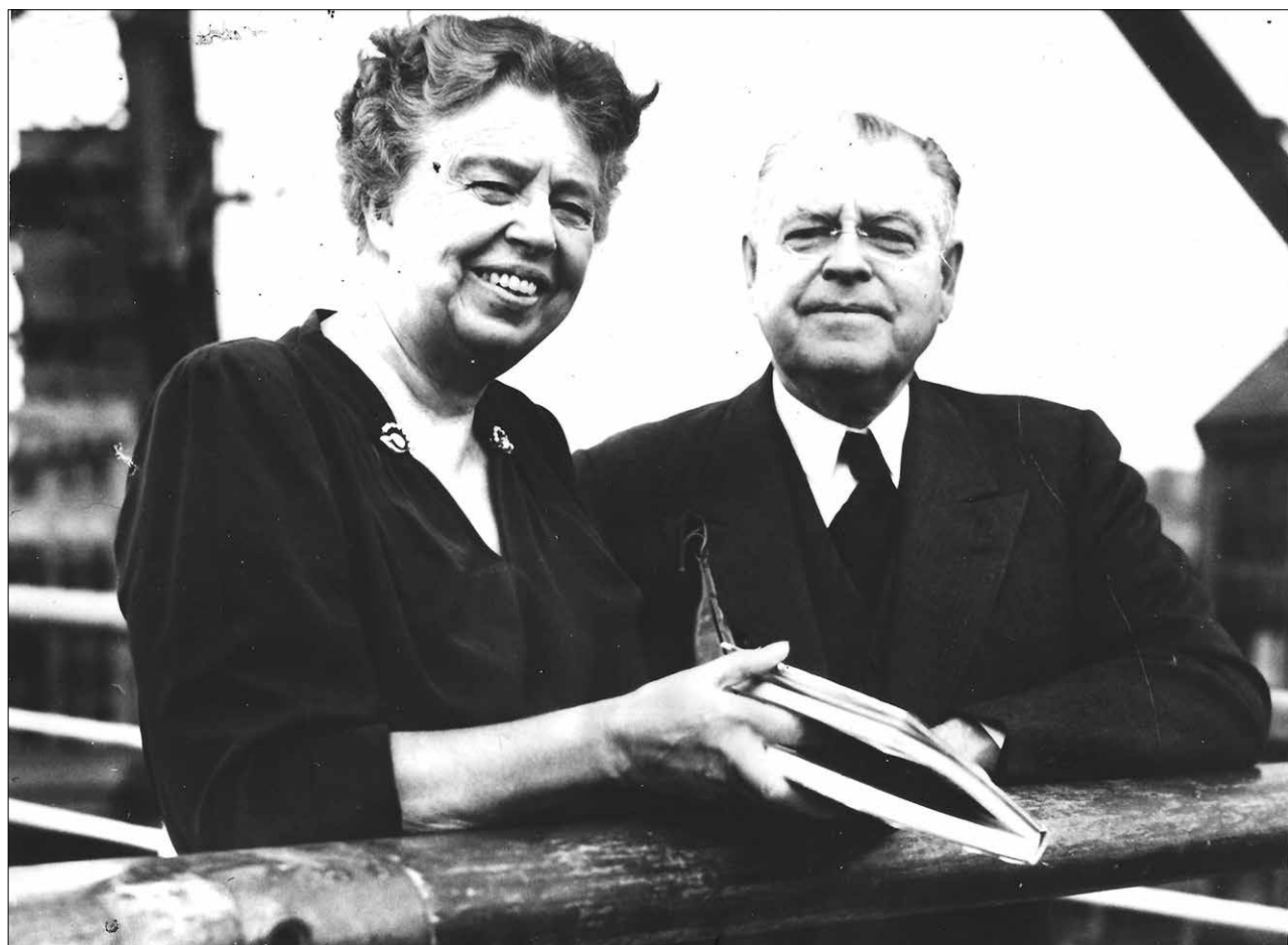
ACME NEWS PHOTO FROM THE AUTHOR'S PERSONAL COLLECTION.